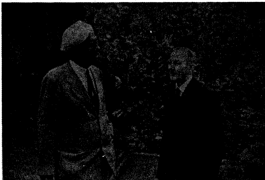
Figure 1. Prof. Heyrovsky in the garden of the Polarographic Institute.