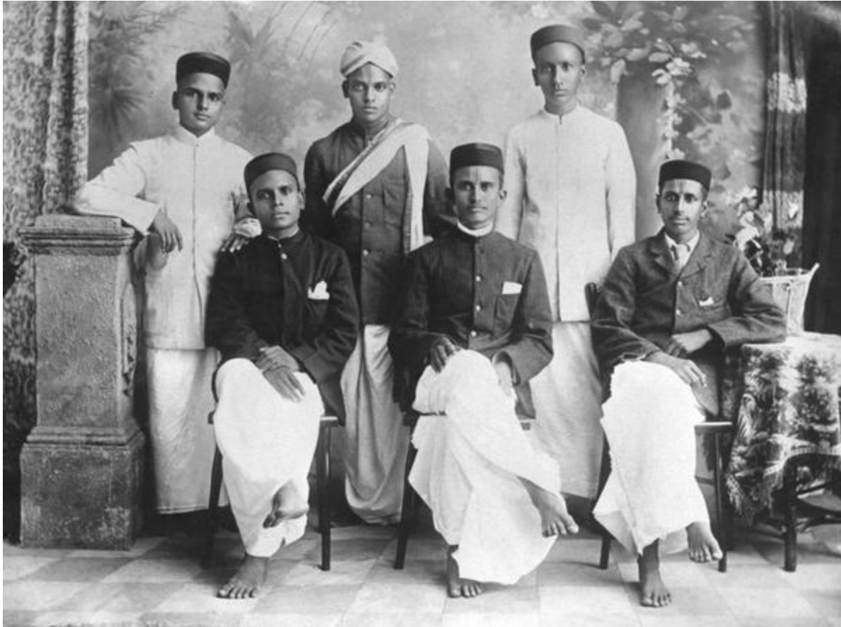
Sir C V Raman with his classmates.

Since his childhood days, common sights like the red and golden streaks of light that gild the sunset sky, the shape of the sailing clouds, the swirl of the roaring tides or the splashing of water on tossing a rock into a pond excited him. The sound of the veena, with which he grew up, listening carefully to his musically endowed mother play, or that of the violin played by his father—stimulated his curiosity, and he would be restless till his father gave him explanations to all the phenomenon he questioned.