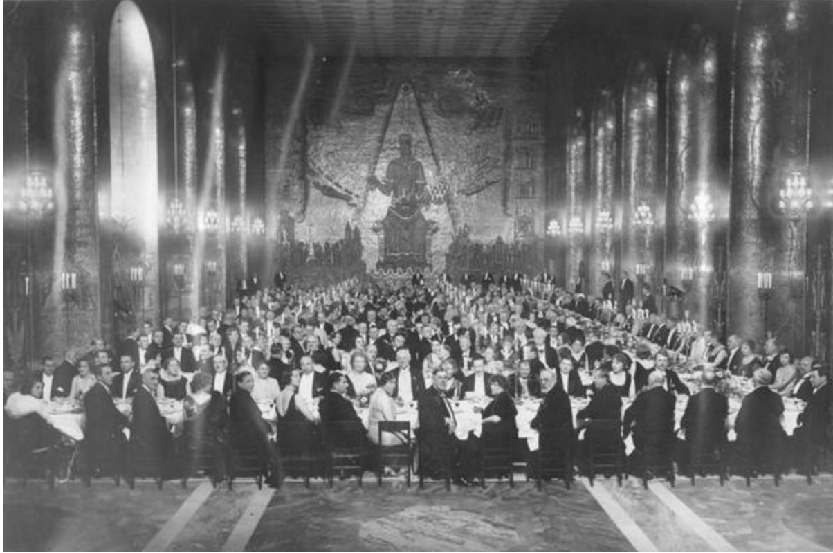
C V Raman at Nobel banquet. Look for the unique white turban to spot him!