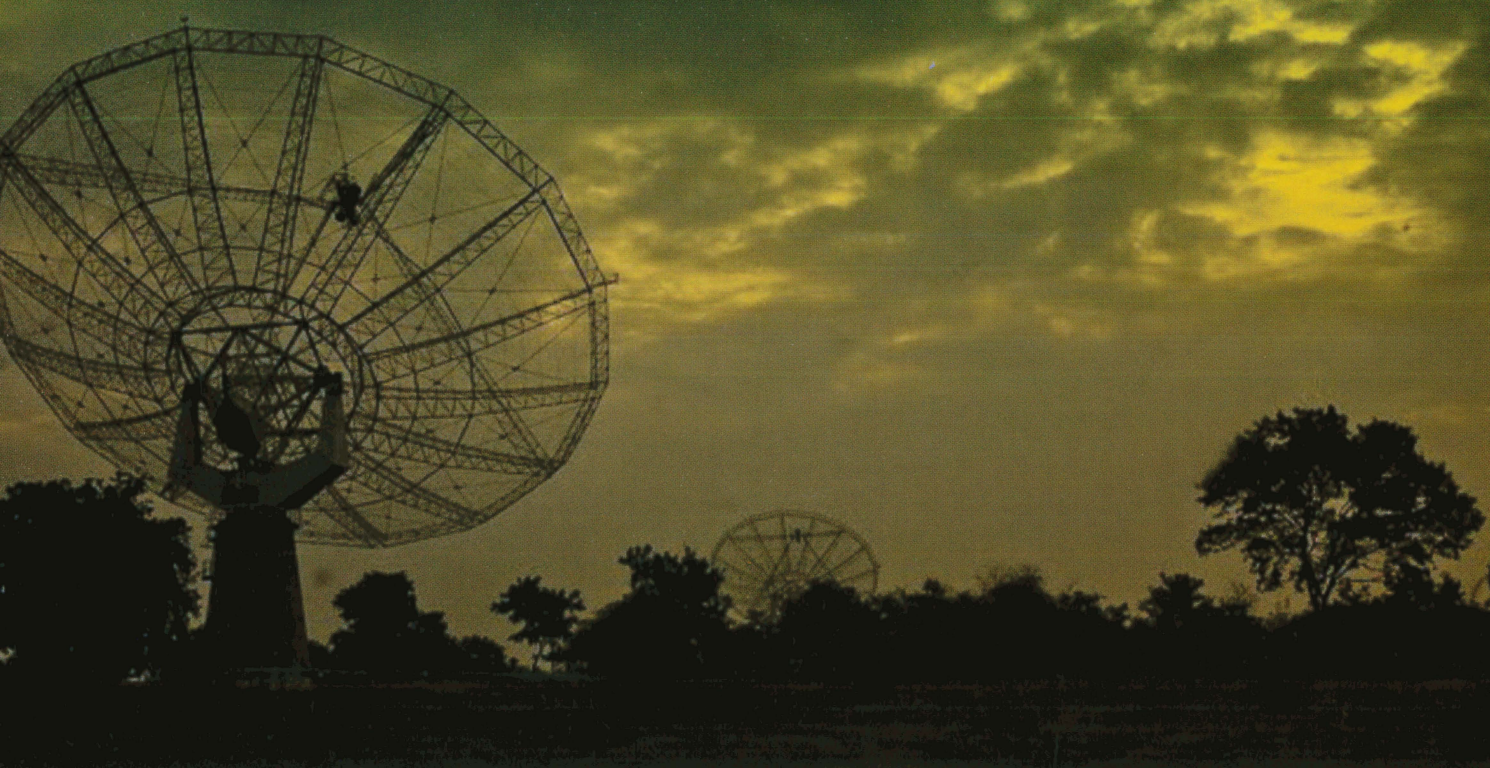
The Giant Metrewave Radio Telescope (GMRT) in Pune India.

doi:10.1038/nindia.2016.86 Published online 11 July 2016